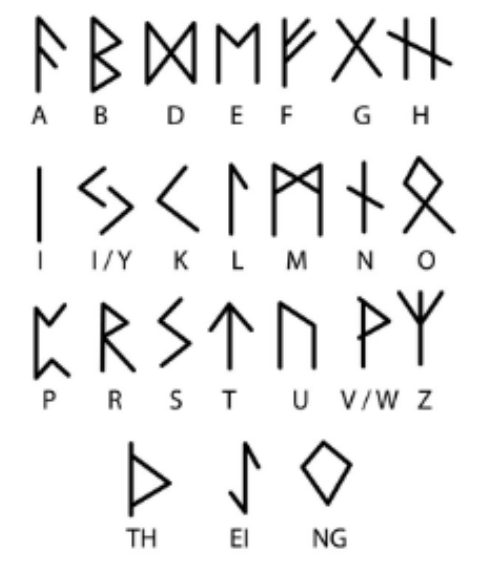
Runic alphabet and its latin letter interpretation vector image

The runic alphabet is 24 letters and is also called Futhark. Futhark is a writing system of uncertain origin used by the Germanic peoples of northern Europe, Britain, Scandinavia, and Iceland from about the 3rd to the 16th to 17th centuries AD. The runes are different from the English alphabet. For example, instead of the letter "C", speakers of Futhark used "K"!