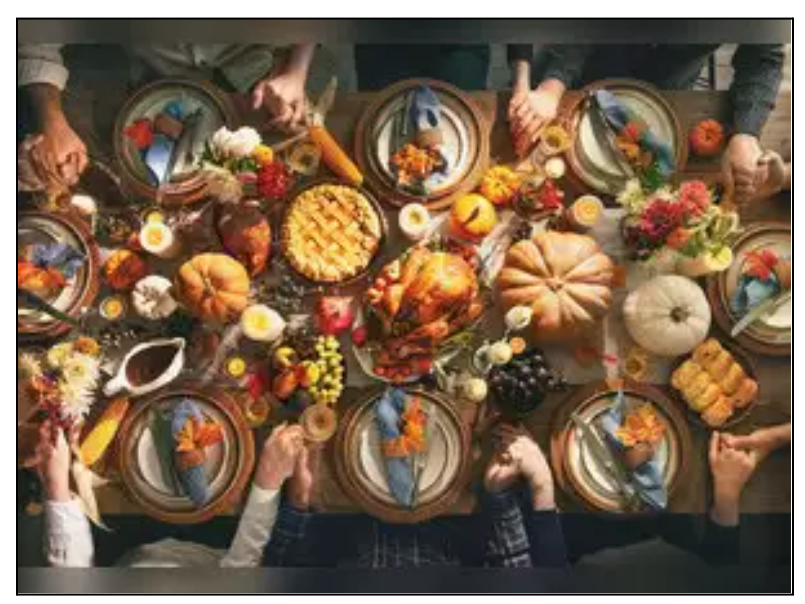
A Thanksgiving Feast

For example, Days of Thanksgiving were celebrated following the victory over the Spanish Armada in 1588 and following the deliverance of Queen Anne in 1605. A unique yearly Day of Thanksgiving was created in 1606 following the failure of the Gunpowder Plot in 1605. This became Guy Fawkes Day, celebrated on the 5th of November.